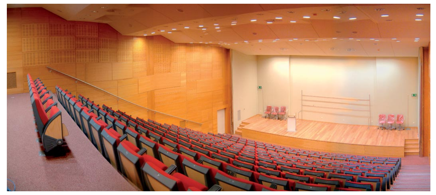
Thessaloniki Science Centre, Greece