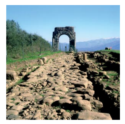
Vía de la Plata, Extremadura, Spain

The Vía de la Plata project in Extremadura, funded by an 85% contribution by the Financial Mechanism, won the prestigious 2005 European Heritage Award in the category Conservation of Cultural Landscapes (see inserted text box). The project received the award for its remarkable achievement in restoring the portion of the eponymous ancient Roman road running through the Extremadura region in South West of Spain. The Europa Nostra Award is one of Europe's most prestigious restoration prizes and is run by Europa Nostra, the pan-European federation for cultural heritage.