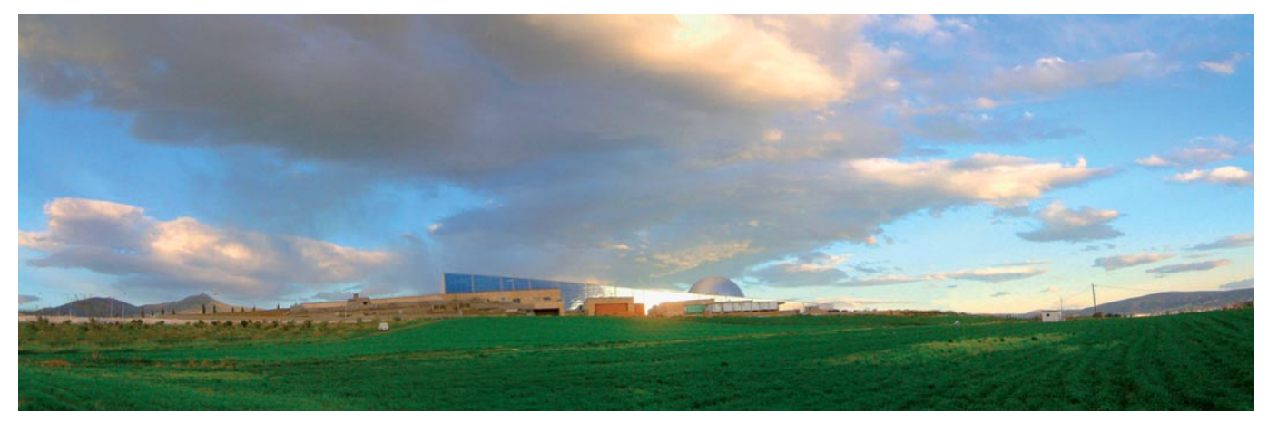
Thessaloniki Science Centre, Greece

The achievements of the Financial Mechanism reflect the true spirit of partnership in development, and have invariably been based on the principle of sustainability to ensure that the goal of sustainable cohesion and development was achieved. The Mechanism has seen donor- and recipient countries collaborate in an extensive consultative process seeking to identify and support projects generating important social results. The philosophy of partnership in development underlying this process goes to the core of the concept of sustainable development, which has been crucial in the Mechanism's endeavours to create social and economic cohesion across the regions of the European Economic Area.