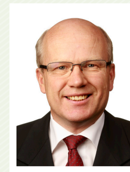
Hårek Elvenes, Conservative Party