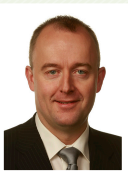
Head of delegation Eirik Sivertsen, Labour Party